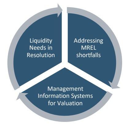
Figure 2: The key topics for the 2022 EREP