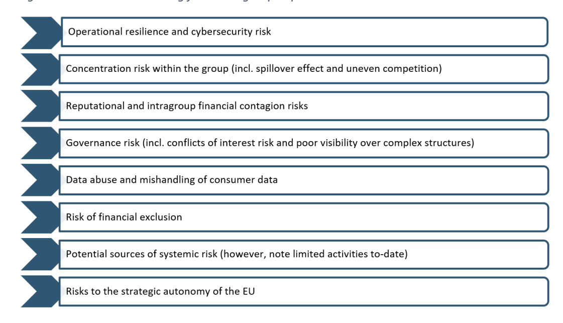
Figure 2: Potential risks arising from intragroup dependencies

Although those inherent to intragroup dependencies have been analysed more in detail, NCAs also highlighted potential external ones.